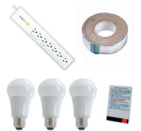
Focus Pack with APS