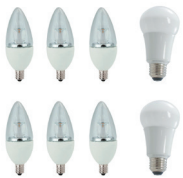
Focus Decorative Light Pack

FOCUS ON ENERGY® wants to help you use energy smarter. We're offering FREE packs with energy saving products for your home.