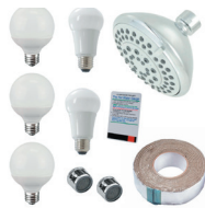
Focus Fixed Showerhead Pack