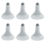
Focus Flood Light Pack