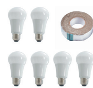
Focus Lightbulb Pack