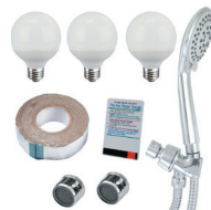
Focus Hand Showerhead Pack